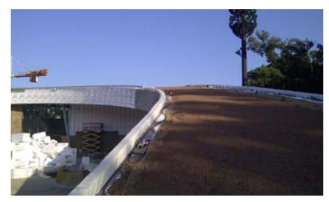
The system substrate suitable for lawn was applied in layer thickness of approx. 100 mm.