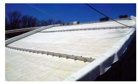
Shear retainers of the type Shear-Fix LF 300 and Eaves Profiles TRP 140 were installed in the steep roof areas in order to derive shear forces into the roof construction.