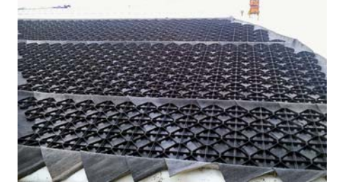
The synthetic Georaster<sup>®</sup> elements, just before being filled with system substrate.