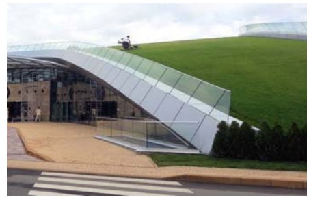
The greenery follows the roof shape down to the ground level and thus integrates the mighty building complex into the landscape.