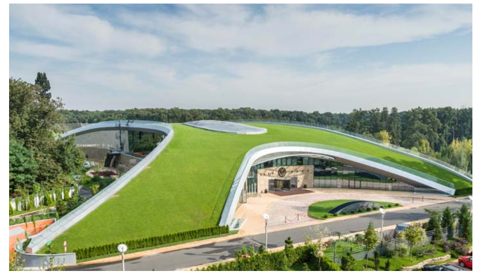
View of the cross-shaped green roof, which is now a component of the landscape.