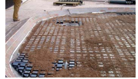
The drainage element Floradrain® FD 60 provides sufficient water retention capacity and made the old permanent irrigation system superfluous.