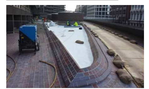
The original planting beds were first laid out with the ZinCo Root Barrier WSB 100-PO.

drought-resistant enough to tolerate low water availability and requiring only little maintenance throughout the year. In addition, the long-proven ZinCo system build-up "Roof Garden" with FD 60 thanks to its high water retention capacity was the ideal solution to provide for a balanced water-air supply, to drain off excess water and at the same time store sufficient water given the absence of any additional irrigation.