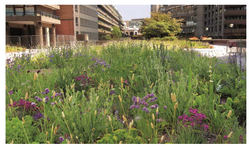
Beech Gardens as part of the Barbican Estate provide recreational green space in the City of London.