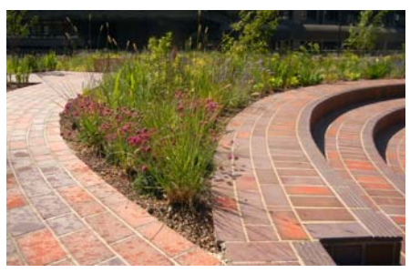
The planting beds were kept to the original layout, however, the vegetation was completely replaced on top of the newly laid out FD 60 build-up.