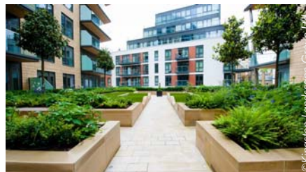
All courtyards were built on top of an underground carpark requiring suitable podium build-ups for drainage management.