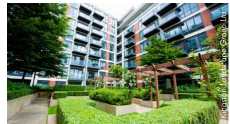
Residential courtyard with large trees and dense hedging and a wooden pergola.