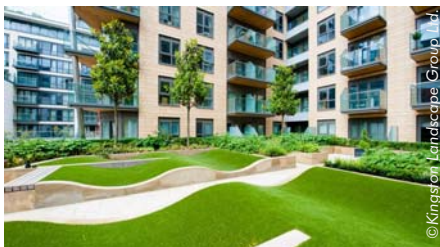
An open design courtyard with rolling mounds made from artificial grass and integrated benches inviting the residents to stay.