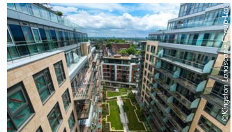
View from above onto one of the courtyards of Dickens Yard residential development.