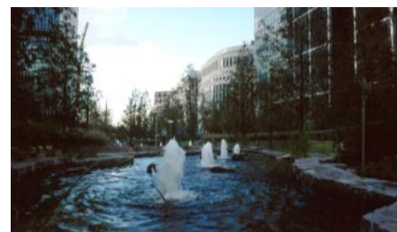
Serpentine stone basins with fountains are the dominant feature of this landscaped park.