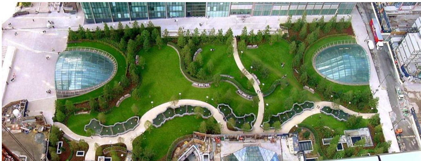
The “Jubilee Park” from above, surrounded of high buildings.