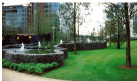
View over the sprawling lawn interspersed with solitary trees and winding paths.