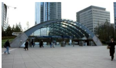
Large entrance leading to the Canary Wharf tube station.