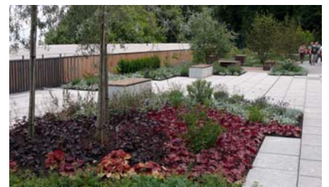
The completed green roof about three months after the opening.