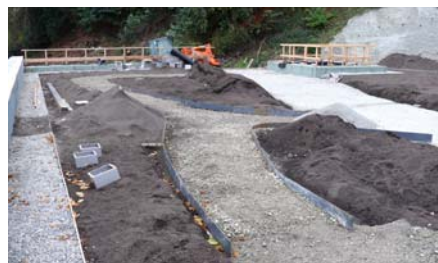
Paths and planting areas during the landscaping works.