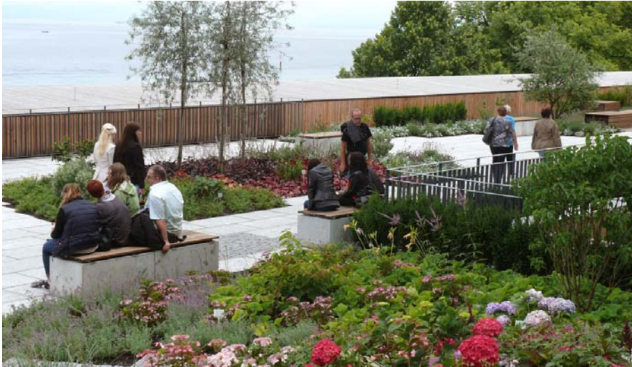
The roof garden of the Comturey Restaurant offers visitors an overwhelming view of Lake Constance.