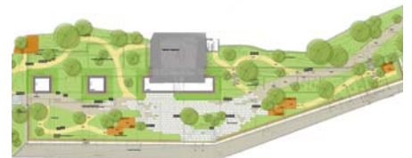
The draft plan shows how the roof garden is integrated into the surrounding landscape. A path which is accessible even with smaller maintenance vehicles crosses the entire roof.