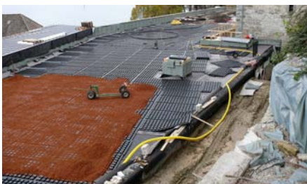
The drainage and water storage element Floradrain® FD 60 makes sure that the overall roof area is being drained properly via its two narrow edges.