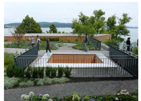
Custom-made guardrails were installed on the ZinCo Guardrail Bases all along the atriums and any other edges.