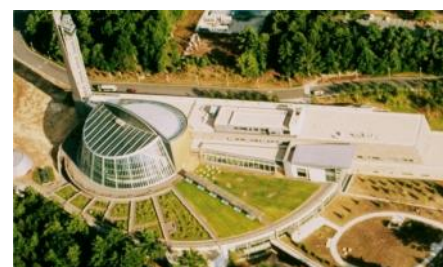
The museum after the construction phase.

topography. Due to the large size of the facility ca. 28.600 m 2 , the Tribe wanted a seamless transition between the museum roof and the adjacent marshland, a 500 acre (200 ha) wetland of significant historical and cultural importance to the Mashantucket Pequot community. The green roof is approximately ca. 7.000 m 2 and covers all of the permanent museum exhibit buildings.