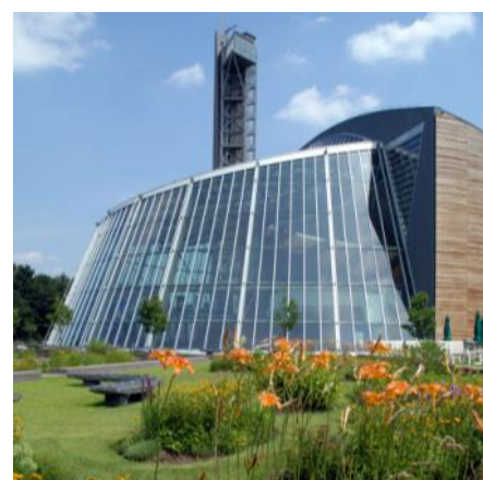
The green roof of the Pequot-Museum is a multi award winning project.