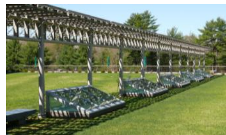
Glass skylights are the only hint to the extensive exhibition facilities below.