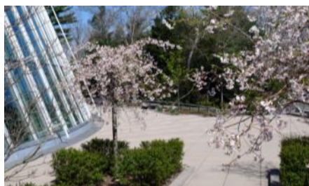
Planting beds with flowering cherry trees and evergreen ground covers.