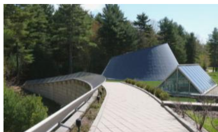
A subtly lit path leads visitors down from the roof into the adjacent forest.