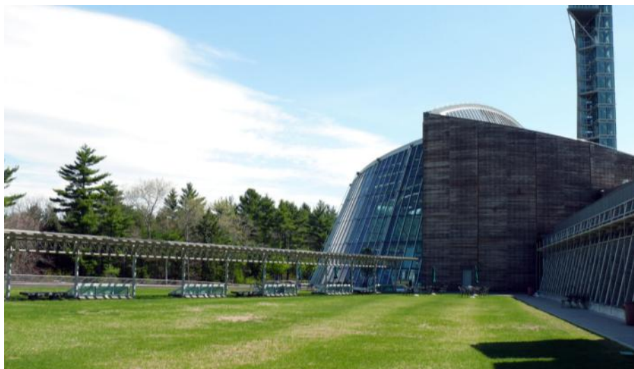
The Mashantucket Pequot Museum and the Research Centre in Connecticut, USA.