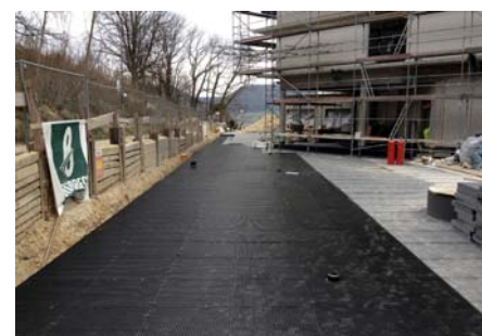
In the overall access area Elastodrain® EL 202 was laid and fixed with corresponding connectors.