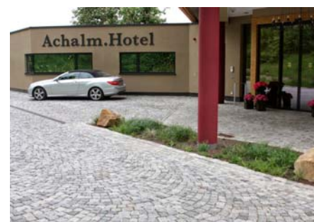
A granite paving – made of used natural stones – was installed at the driveway to the entrance of the hotel.