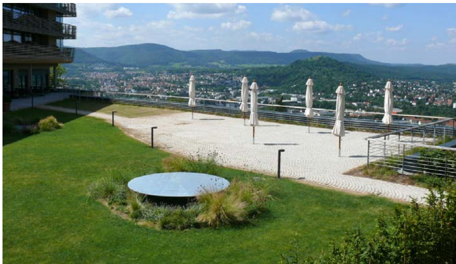
The plants on the terrace originate from the southern German mountains where the Achalm is situated as well.