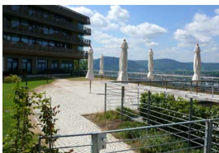
One option for guests to reach the hotel is crossing the terrace.