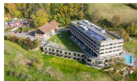
The Achalm.Hotel situated in the nature reserve seen from the air.