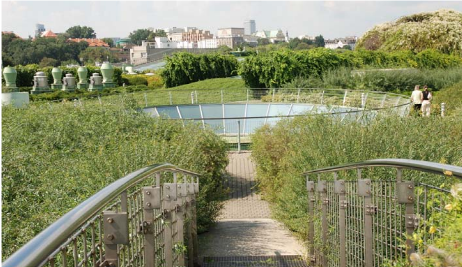
The impressive roof garden on the University Library of Warsaw.