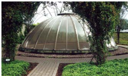
The big glass dome will be covered by a second "dome" off climbing plants.