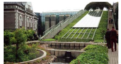
Over stairs on both sides of the pitched green roof you get on the main roof garden.