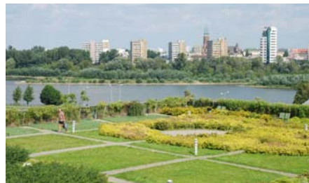
The different plant beds are divided by walkways. In the background you see the "Vistula River".