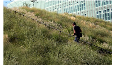
In September 2011 one could hardly recognize the stairs between the tall grasses.

System Substrate "Roof Garden" Filter Sheet SF Floradrain® FD 60 Protection Mat ISM 50 Roof construction with root resistant waterproofing