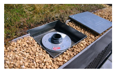
The Run-off Limiter Set is installed above the roof