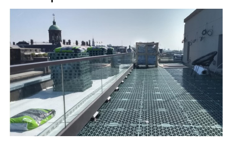
The RSX 65 spacer elements are placed on top of the Protection Mat SSM 45.