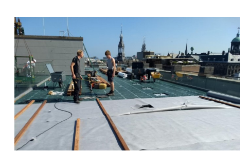
The Filter Sheet PV prevents fine particles from being washed out into the spacer elements.