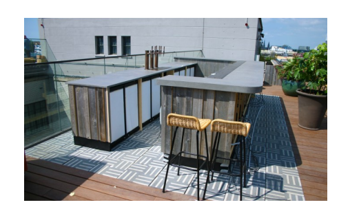
The bar is built on stylish slabs with a grey and

Roof construction with root resistant waterproofing