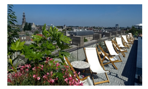
Comfortable lounge furniture and deckchairs invite visitors to stay and enjoy the roof.

The vegetation in the aluminium planters close to the roof edge has been carefully chosen to thrive in the special roof conditions.