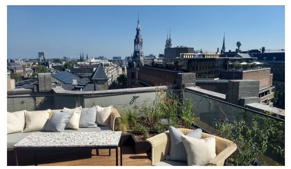
The spectacular view of Amsterdam makes this roof garden a very special place.