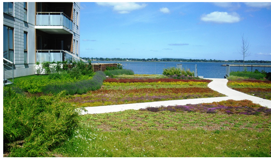
According to the development plan the view to the sea was not blocked.