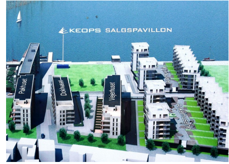
The architect's model shows how the newly designed district at the harbour should look like.

Coordinates: 55°43′10.90″N 11°43′02.85″E