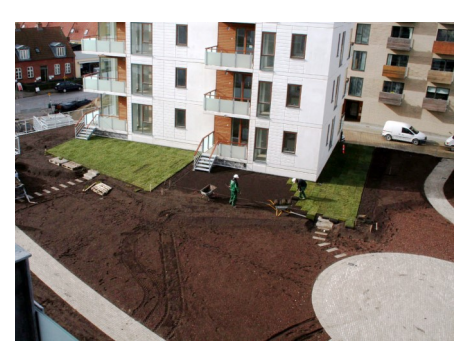
After completion of the rough works on the underground garage roof, the turf in the private gardens was laid.