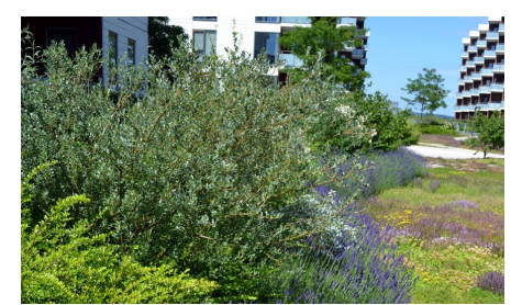
Perennial plants such as Lavender set visual accents as a framework.

Plant layer according to Plant list System Substrate Filter Sheet SF Floradrain® FD 40-E Protection Mat SSM 45 Roof construction with root resistant waterproofing