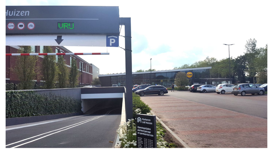
Underground garage with additional benefit: As space is limited in urban areas, cars park on several levels