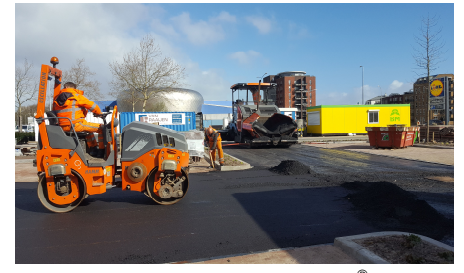
Heavy vehicles can drive on Elastodrain<sup>®</sup> EL 202 to asphalt the driveway.