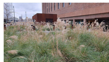
the area between the old Power station building and phase 1 Circus West Village completed in 2017.

Filter Sheet SF Floradrain FD® 60 neo Protection Mat ISM 50 Roof construction with root resistant waterproofing