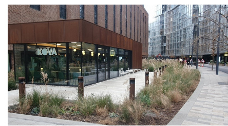
Shops, restaurants, cafés, offices, and leisure facilities provide everything residents might need.