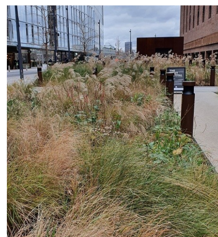
A modern vegetation concept using a great variety of drought resistant grasses was implemented in

shops, offices, restaurants and leisure space built in 8 phases. In phase two finished end of 2021, the ZinCo system "Roof garden with FD 60 neo" was used for the hard and soft landscaping scheme in front of the Power station building. This is a massive podium deck and below ground there is the equivalent of a 6 storey high 'excavation' which houses the entire energy plant for the Battersea redevelopment complex. Thanks to its high water retention capacity FD 60 neo is the ideal solution to allow for a balanced water-air supply, to drain off excess water and at the same time store sufficient water especially if no additional irrigation is provided.