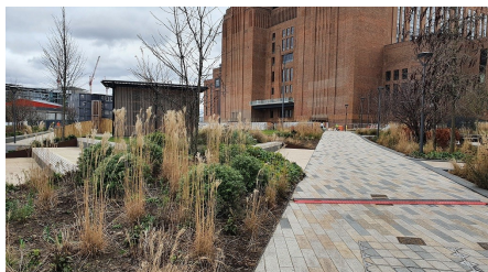
Hard and soft landscaping was installed on the podium deck in front of the Power Station using a FD 60 neo build-up. This has created vast recreational areas merging into 6 acres of riverfront park along a stretch of the river Thames which has not yet been accessible to the public.