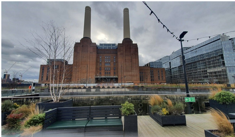
From the Thames Embankment, there is a wonderful view of the renovated façade of Battersea Power Station.