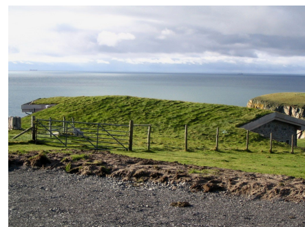
The green roof connects seamlessly with the surrounding grass and heather landscape, making the building almost invisible.