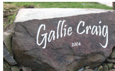
Gallie Craig – named after the "Mull of Galloway" headland rising out of the sea like a "craggy rock".