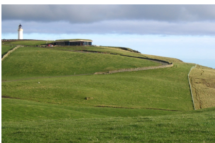
The 26 m high lighthouse and Gallie Craig housing a restaurant and gift shop are local attractions.

Waterproofed roof construction plus root barrier