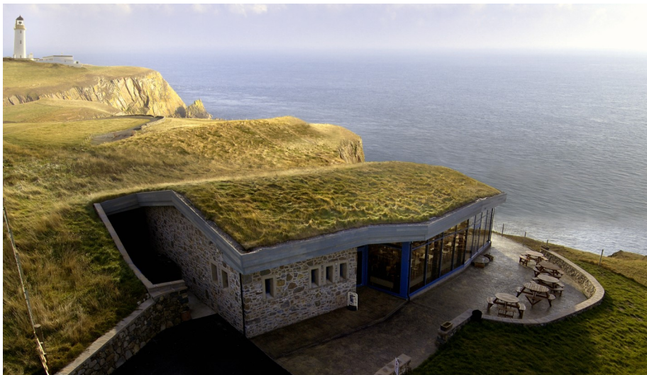
Due to the turf roof, an extraordinary level of harmony with the surrounding landscape was achieved.