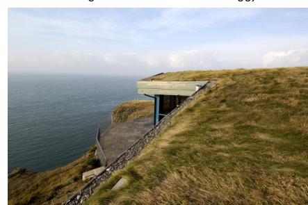
Gallie Craig sitting on almost vertical cliffs offers breath-taking views across the Irish Sea