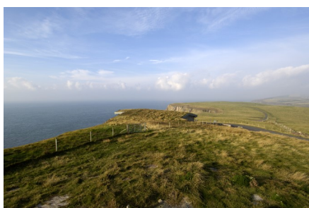
Located in a nature reserve, special planning and approval was required to build Gallie Craig