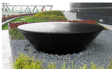
Water basin on the 22 nd floor in an exposed position.