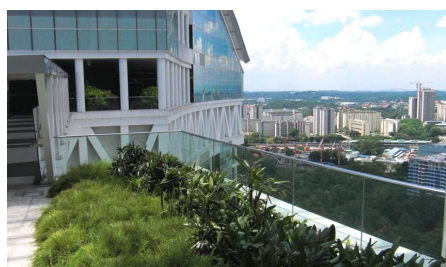
A garden floating in the sky.