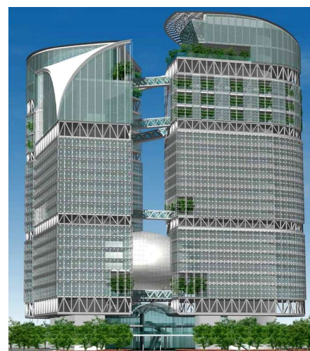
The three Fusionopolis towers are connected by skybridges.

practical use for the occupants. The main gardens are situated on the crucial floors with the transitions to the other towers. These roof gardens have a dense vegetation comprising trees with heights of up to 5 metres and shrubs of up to 1.5 metres. Furthermore, many small but visible gardens were built on balconies in the outdoor areas of all of-fices. They were spread over the total height of the complex.