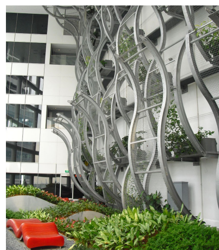
Very impressive type of vertical greenery.