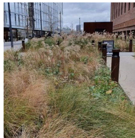
A modern vegetation concept using a great variety of drought resistant grasses was implemented in