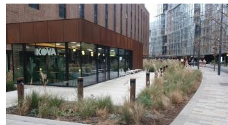
Shops, restaurants, cafés, offices, and leisure facilities provide everything residents might need.