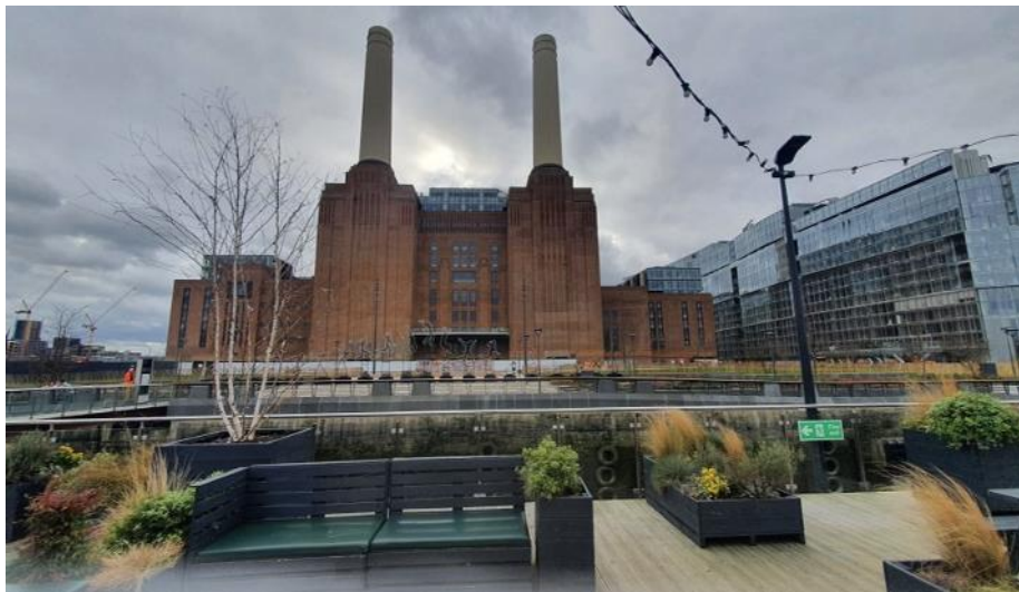
From the Thames Embankment, there is a wonderful view of the renovated façade of Battersea Power Station.