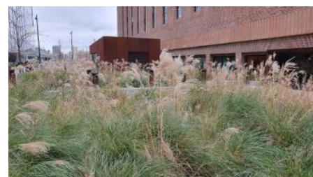
the area between the old Power station building and phase 1 Circus West Village completed in 2017.