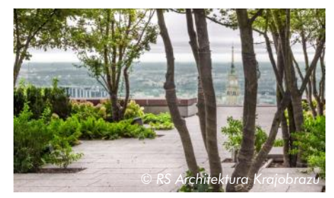
In the background of the vegetation you can still see the famous Palace of Culture in Warsaw.