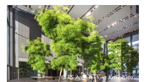
The 9 metre high olive trees in the lobby of the Varso Tower thrive on the ZinCo system build-up with Floradrain® FD 40-E.

level of which is open to the public. Here, beautiful green spaces enchant the outdoor area above the underground car parks and trees even grow in the lobby of the Varso Tower. A green world has been created inside, outside and on top of the building roofs using ZinCo roof greening systems including a skyscraper garden at a height of 205 metres.