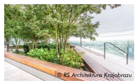
The trees at Varso Place are more than a decade old, having been selected, nurtured and then replanted at a tree nursery three years earlier.