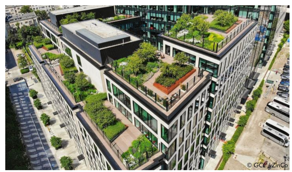
Wonderful green spaces bring all the roofs of Varso Place to life (pictured is the Varso II building section).