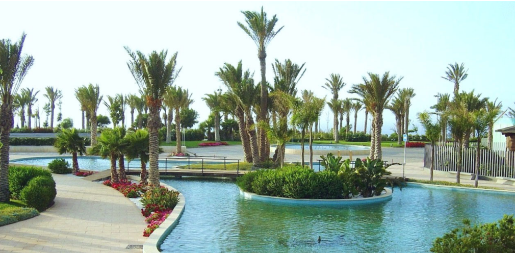
The park resembles an oasis which allows for visitors to walk through.