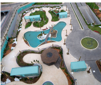
The spectacular view from one of the hotel rooms shows clearly the architectural concept of the park with its circle elements and curved lines.

To secure the 6-8 m tall palm trees against wind uplift huge reinforcement steel meshes have been embedded within the substrate to anchor the large root balls of the trees.