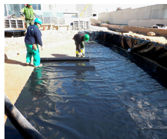
In the planting areas demarcated by stone walls the Zinco Root Barrier WSF 40 has been laid first.