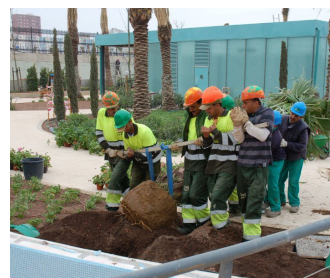
The palm trees with a height of up to 8 m, some of them even with multiple stems, were planted by joining forces.