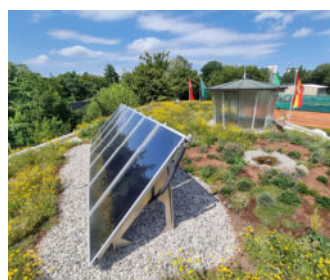
A green roof is perfect to be combined with a solar system because it creates synergy effects.