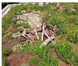
Gravel or stony areas and deadwood are major structural elements of the Biodiversity Green Roof as they provide nesting places and shelter for animals.