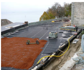
The drainage and water storage element Floradrain® FD 60 makes sure that the overall roof area is being drained properly via its two narrow edges.

The weight of the green roof build-up played an exceptional role in the construction as it contributes to the building withstanding the slope pressure.