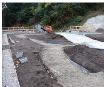
Paths and planting areas during the landscaping works.