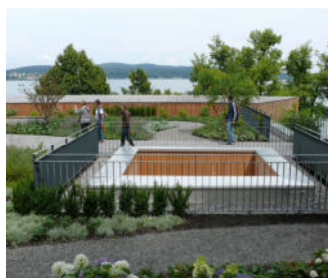
Custom-made guardrails were installed on the Zinco Guardrail Bases all along the atriums and any other edges.