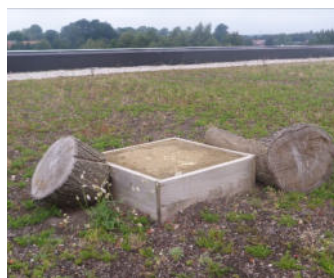
Deadwood and sand pockets are useful habitats and breeding grounds for native animals.