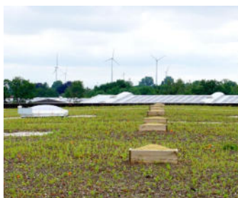
In spring, the vegetation period starts and brings out a soft green.

basis of the results of the research project "Roofs For Biodiversity". In some demarcated areas the vegetation was established in such an exclusive way as to apply certified regional seeds and raked material from local sandy xeric grassland on the prepared substrate areas. The raked material contained seeds, moss and lichen. In addition, local Sedum cuttings were applied. Precisely the species which are typical of the region, provide the suitable food supply for many native animal species.