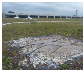
Specifically established water bodies improve the water supply for insects and birds.