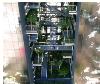
The open vertical garden with its 300 palm trees and other tropical plants extends over the full height of the building, from its entrance, over the small balconies and landings, up to the roofs at about 100 meters of height.