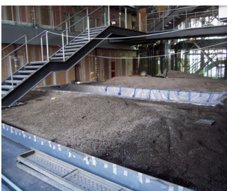
The green roof system build-up "Roof Garden" was applied as a substructure within the planters.

The system build-up "Roof Garden" based on the drainage element Floradrain® FD 60 offers an adequate substructure for the intensive plantings.