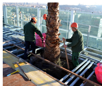
The large palm trees were positioned within the planters by joining forces.