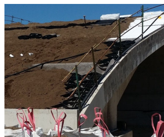
Floraset® FS 75 and Georaster® elements were installed in the pitched and steep pitched areas to prevent the substrate from sliding.