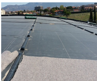
Stable shear barriers were concreted onto the roof and sealed in order to transfer the shear forces into the roof structure. The Protection Mat BSM 64 was laid on top of the root resistant waterproofing

vineyard vegetation and the numerous vines in front of the building leave no doubt as to where you are. Due to the barrel shape of the roof, the tried and tested pitched roof systems with FS 75 in the less steep areas and Georaster® in the steepest areas of the roof were used for the greening. This prevents the substrate from slipping. The considerable shear forces due to the size of the pitched roof are safely transferred into the roof structure by concrete shear barriers.