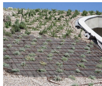
Good irrigation is important during the vulnerable growth phase after the initial planting in 2017. In steeper roof areas, the driplines are attached to separate lattices.