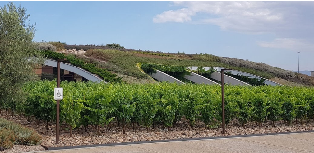
The green roof and the vines in front of the building have developed wonderfully in the 3 years since they were planted, creating a unique and inviting ambience.