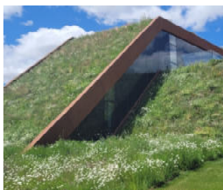
It actually looks as if the colourful meadow flowers are climbing up the roof.