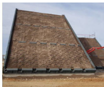
The system substrate Roof Garden is held firmly in place in the 100 mm high Georaster® elements.