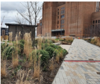
Hard and soft landscaping was installed on the podium deck in front of the Power Station using a FD 60 neo build-up.

built in 8 phases. In phase two finished end of 2021, the Zinco system "Roof garden with FD 60 neo" was used for the hard and soft landscaping scheme in front of the Power station building. This is a massive podium deck and below ground there is the equivalent of a 6 storey high 'excavation' which houses the entire energy plant for the Battersea redevelopment complex. Thanks to its high water retention capacity FD 60 neo is the ideal solution to allow for a balanced water-air supply, to drain off excess water and at the same time store sufficient water especially if no additional irrigation is provided.