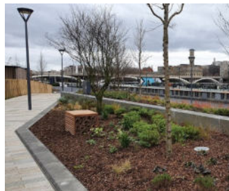
This has created vast recreational areas merging into 6 acres of riverfront park along a stretch of the river Thames which has not yet been accessible to the public.