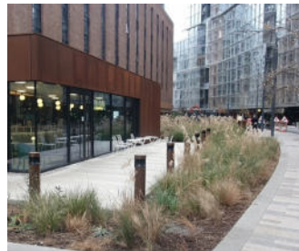
Shops, restaurants, cafés, offices, and leisure facilities provide everything residents might need.