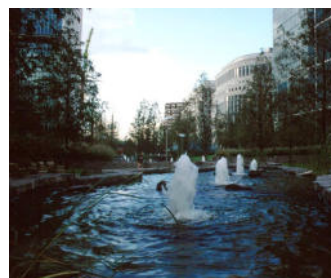
Serpentine stone basins with fountains are the dominant feature of this landscaped park.