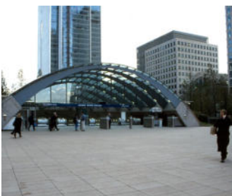
Large entrance leading to the Canary Wharf tube station.

It was established on time for the Golden Jubilee celebration of Queen Elisabeth II and was named after that anniversary.