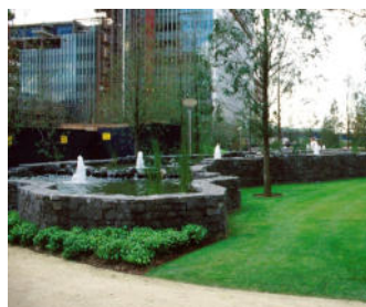
View over the sprawling lawn interspersed with solitary trees and winding paths.