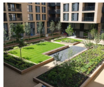
One of the blue podiums a few months after the installation. Vegetation has established very well.