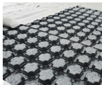
RS 60 retention spacers were used on all green roofs providing retention space below the wildflower/sedum build-up.