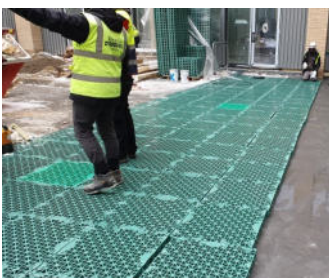
The heavy duty RXS spacers were laid on all podiums allowing them to be used as roof gardens with hard and soft landscaping.

situated for example over a car park or entrance hall and providing community space to the residents. In addition, the apartment block roofs have 26 blue roofs with a green roof installed on top. These are seeded with a biodiverse mix of native wildflowers, sedum and grasses. On all roofs the “Stormwater Management Roof” build-up came to use. While RS 60 spacers were installed as system core pieces on the blue/green roofs, heavy duty RSX spacer elements were used on the landscaped podiums.