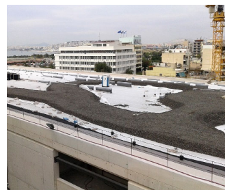
Glass foam gravel was used in some areas in order to achieve a higher total build-up.