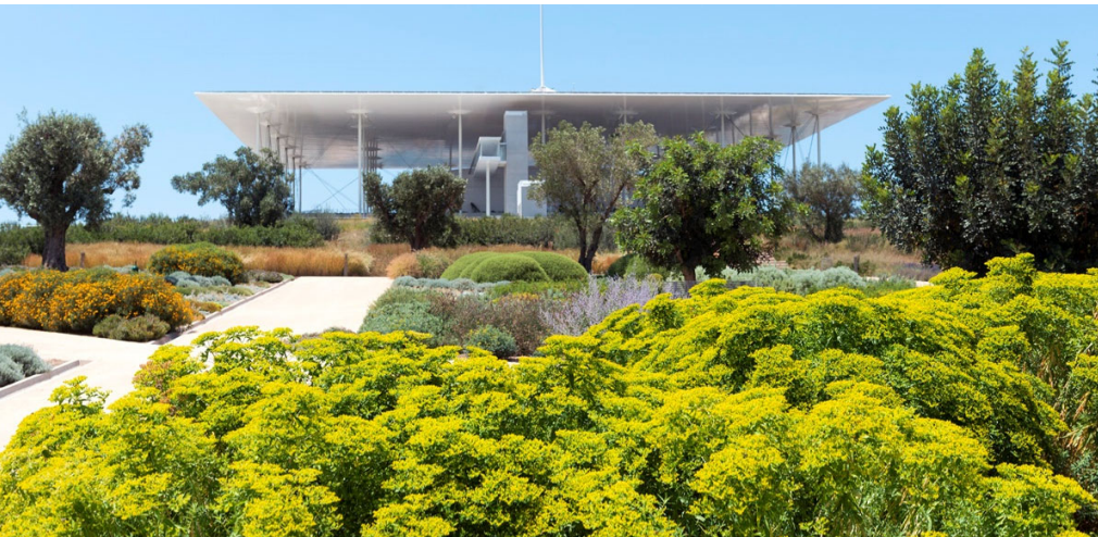
The roof of the opera is covered with a ca. 10,000 m 2 large solar plant.