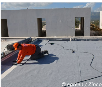
The protection mat TSM 32 is the first layer to be installed with an overlap on the root resistant waterproofing.

The green roofs protect the waterproofing from environmental impacts, provide an enhanced sound insulation and, in summer a cooling effect caused by evaporation. To achieve a lasting vegetation, it was essential to choose plants which were tailored to suit the Mediterranean climate. Therefore different drought-resistant species were selected, and the clear and calm cube structure was stressed by planting only one species on an individual roof area.