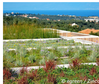
A clear pattern emerges because the individual roof areas are planted with only one type of plant – with low-growing and taller species and all kinds of flowering colours.