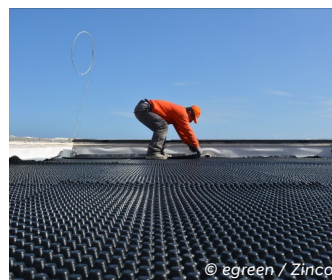
The Floradrain® FD 25-E drainage and water storage elements regulate the water balance in the System Build-up.