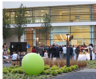
The companies which are situated in the office complex often hold their events in the courtyard.