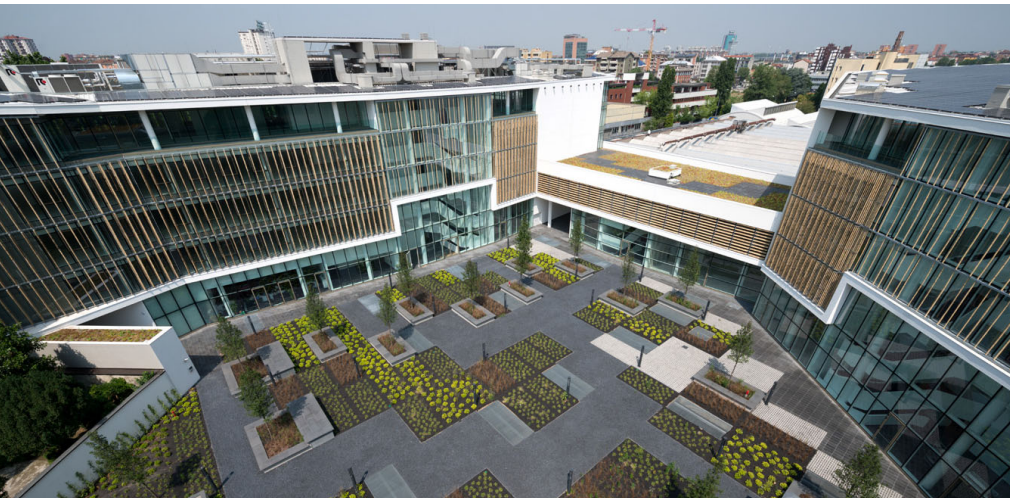
Each of the offices allows for a fantastic view of the modern design rooftop garden.