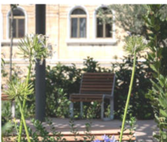
The complete furniture consists of a harmoniously matching comfortable wood/aluminium-system.

activities, both exposed to the sun for the colder months and shaded for the warmer months. Technically, all this was realised on the fully laid Floradrain® FD 40-E. The trees on the roof are exposed to high forces due to wind pressure and wind suction, which is why the Robafix® tree anchoring system was used. It is installed without any roof penetration.