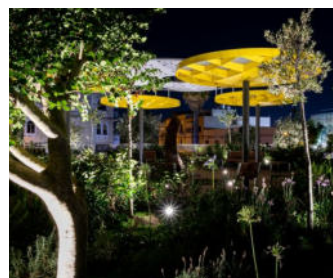
Thanks to an LED lighting system the roof garden is sufficiently safe also during the hours of darkness.