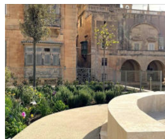
The natural stone of the benches is from a local quarry.