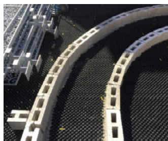
The drainage and water storage element Floradrain® FD 40-E, fitted across the entire area, is used as a permanent formwork for the pathway made of concrete hollow blocks.