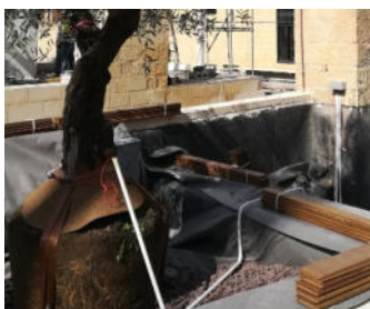
With the tree anchor system Robafix®, the tensioning straps are attached to three anchor points of the grid element, thus permanently securing the root ball.

inspiration. The entire area is divided into ca. 270 m 2 of walkways and ca. 230 m 2 of planted space. From a technical point of view, all this was realised above the Floradrain® FD 40-E elements which were applied across the entire area. Under the walkways they were also used as a permanent formwork. As trees on a rooftop are exposed to high forces from wind pressure and wind suction, the tree anchorage system Robafix® was used. It is installed without any roof penetrations.